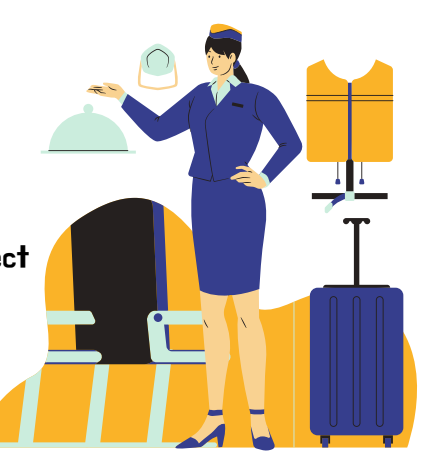
She's a flight attendant.