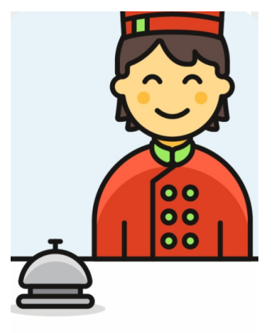
He's a receptionist.