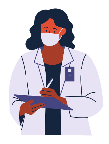
She's a doctor.