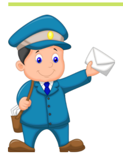
He's a mail carrier.