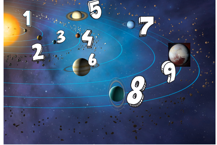
Approximate Average distance from the Sun

Roy Seagrove – Rower Age: 38 Height: 1 m90 Weight: 95 kg These are his fifth Olympic Games Three Olympic medals up to now